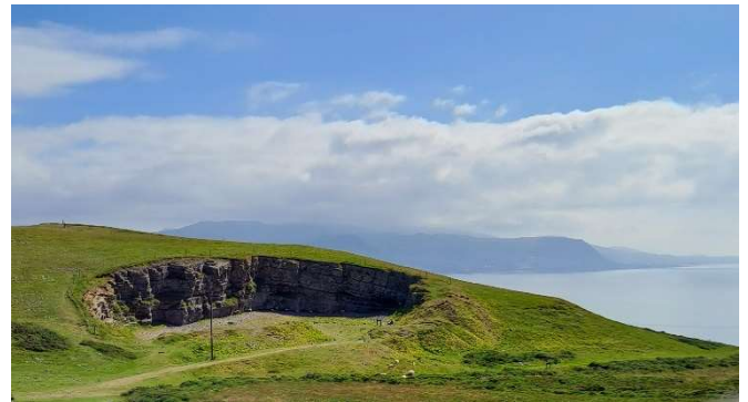
Glorious weather for the glorious view from Great Orme

Once again, the sun shone brightly in Llandudno. As the coach dropped us off near the seafront, the group dispersed in different directions. A few of us headed straight to the tram station to be taken up to the Great Orme. We enjoyed lunch taking in the spectacular views.